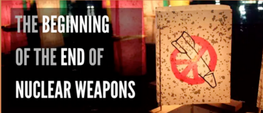
The Beginning of the End of Nuclear Weapons

Nuclear War: A Scenario by Annie Jacobsen